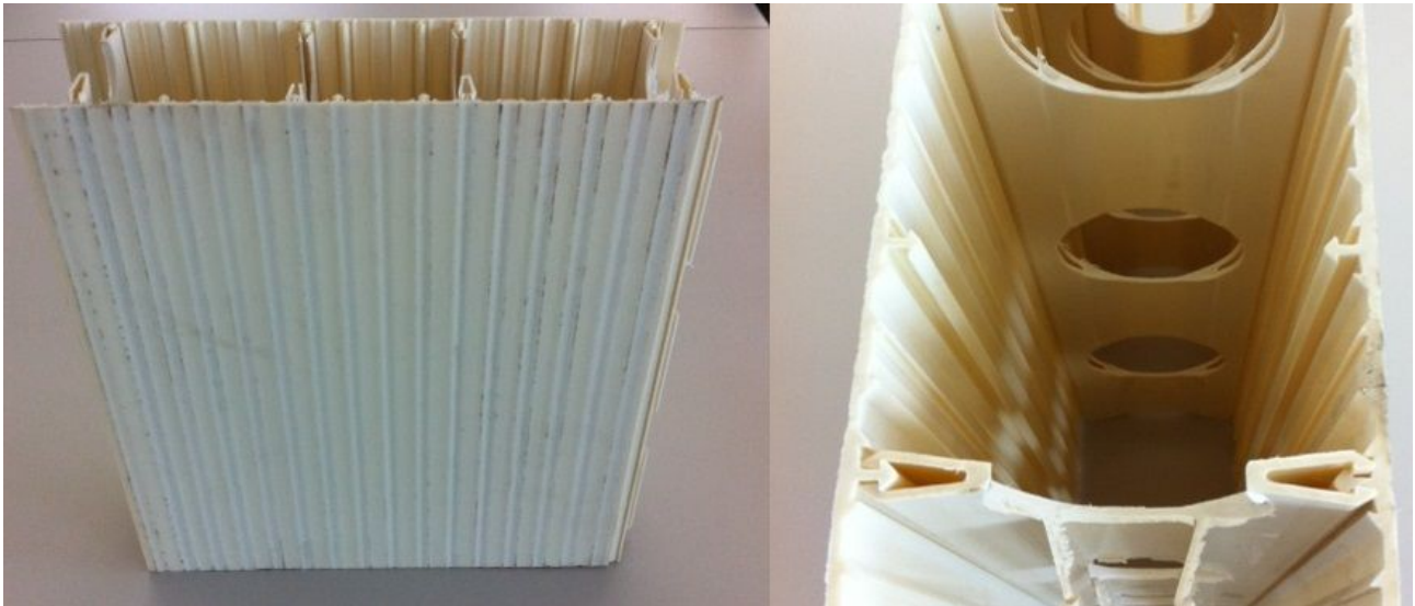
FIGURE 1 PERMAFORM PHOTOGRAPHS

Permaform also provides 150 mm and 200 mm thick systems. Information is available in the brochures and on the website, but Rudds has not been provided with a sample of the 150 mm or 200 mm wide system. On the understanding that the face panels are the same as for the 110 mm system and the link panels are the only change, Rudds expects a total concrete thickness of not less than 140 mm for the 150 mm system and 190 mm for the 200 mm system when the panels are filled.